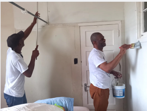
Men at work at the Centre