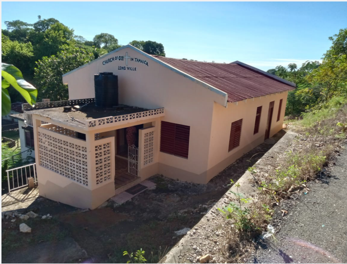
New Longville congregation 65th Church anniversary (July 2023)

We celebrated with some of our congregations in special services to commemorate their anniversaries. Congratulations must be extended to the past and present leadership, and membership for their stewardship over these fellowships. Those that were brought to the attention of the National Office are: