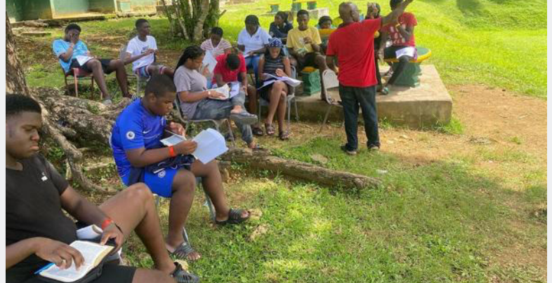
2023 National Youth Camp Merlene Ottey High School, Hanover