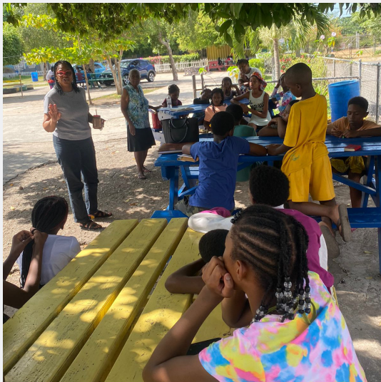
2023 National Children Camp Ardenne Preparatory & Extension High School, Kingston

There is increasing interest and engagement of our youth and children and these are commendable efforts. Our National Youth Directorate, NYE, Sunday School and Christian Education Department have accepted the urgency to strengthen and grow these two cohorts.