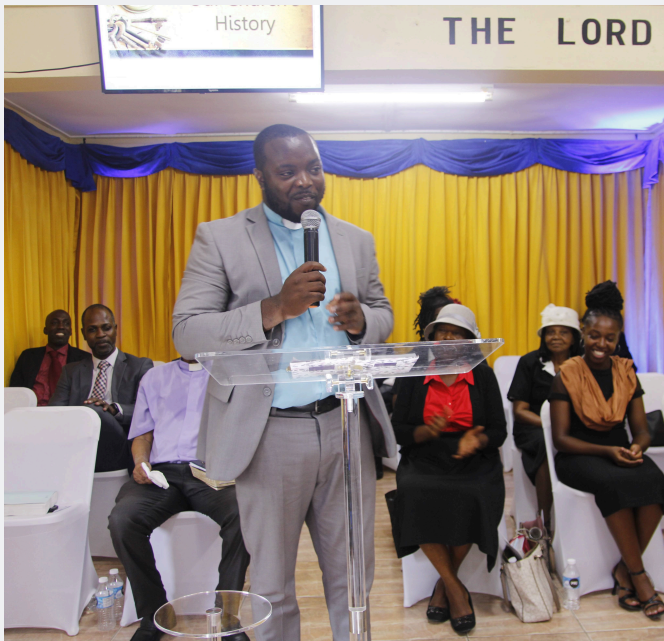
Lluidas Vale congregation - 109th Church anniversary (August 2023)

We celebrated with some of our congregations in special services to commemorate their anniversaries. Congratulations must be extended to the past and present leadership, and membership for their stewardship over these fellowships. Those that were brought to the attention of the National Office are: