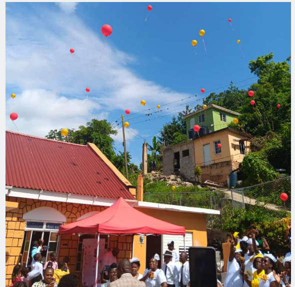
Grove Place congregation 100th Church anniversary (August 2023)